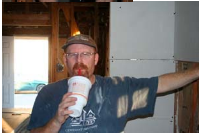
missions trip to New Orleans