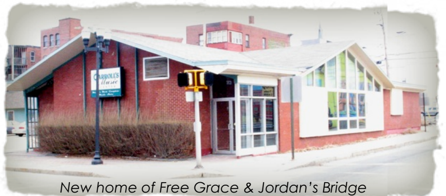
New home of Free Grace & Jordan's Bridge

Free Grace has just signed a lease on its own building in Lewiston. This will free us to hold weekly worship services and establish a solid presence in the community. It would also provide a permanent counseling office for Jordan's Bridge. We are preparing to move in April 1 st , followed by weekly services beginning on the first Sunday of May, May 2 nd . So, there's the exciting scoop: several reasons to be thankful and to be praying.