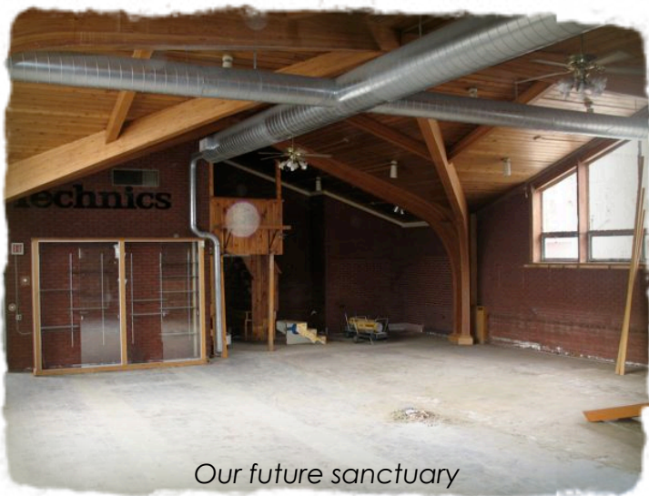
Our future sanctuary

Another huge thank you goes to all of you, our supporters, for encouraging us, praying for us and for funding God's good work in Maine through Free Grace and Jordan's Bridge. God has answered our prayers, and yours, by establishing and working through these two ministries.